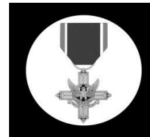
DISTINGUISHED SERVICE CROSS ARMY