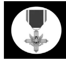
DISTINGUISHED SERVICE CROSS ARMY